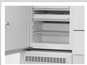
Standalone or undercounter installation with a large interior.