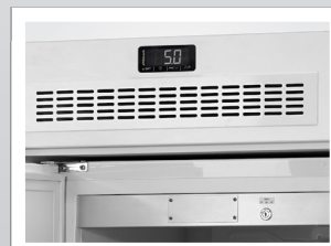
User friendly with automatic defrosting and electronic temperature controller that can be installed into furniture front.