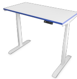
LT-120 BS-040107-EK Height adjustable desk