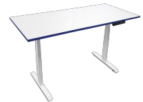
LT-180 BS-040107-HK Height adjustable desk