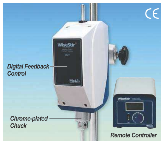
High-Speed Digital Overhead Stirrer, with Remote Controller, □HS-100T□Unit only