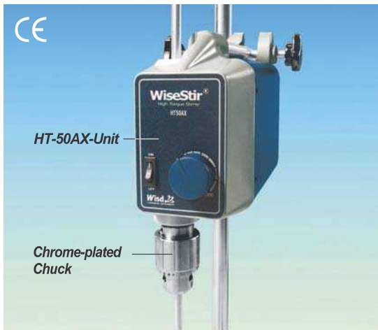
Analog High-Torque Overhead Stirrer, □HT-120AX□Unit only

※ Refer to page 149 for Product Line & Selection Guide